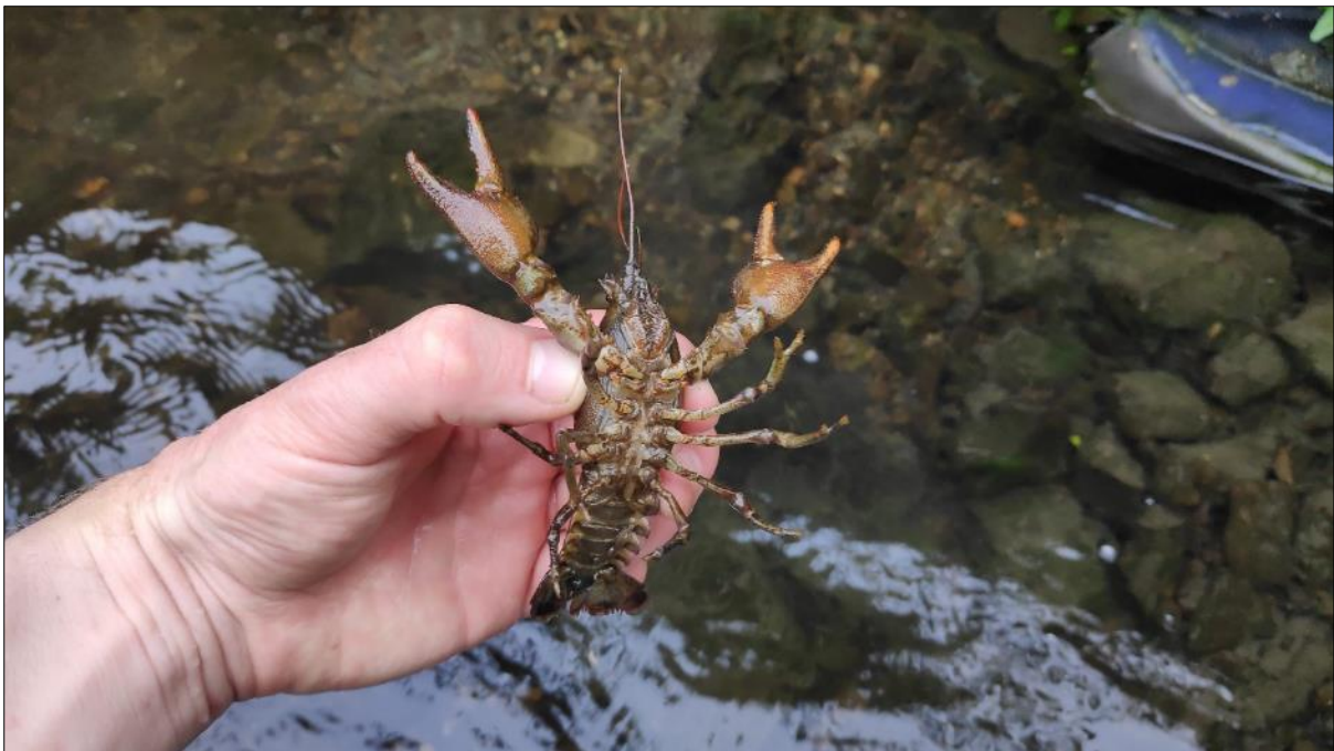
Plate 3.6 One of many white-clawed crayfish recorded from site 5 via hand searching in July 2022