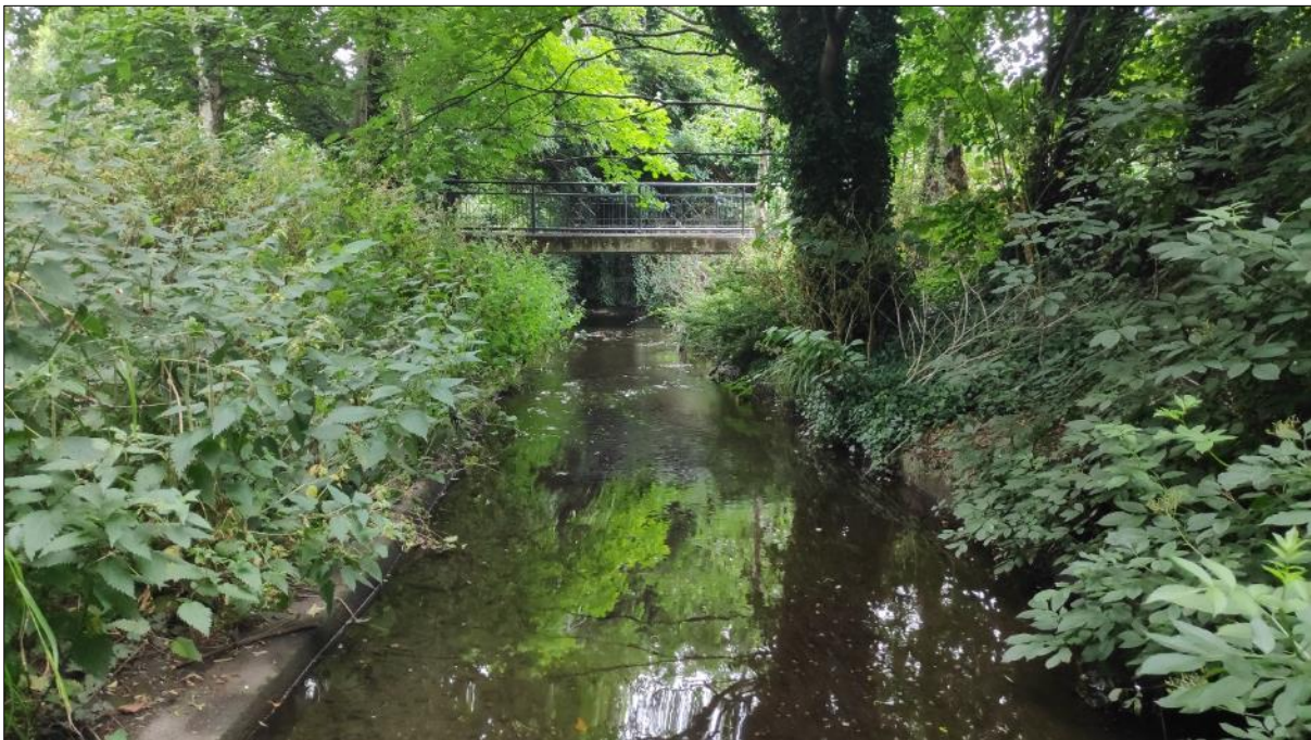
Plate 3.3 Representative image of site 3 on the River Poddle in Mount Argus Park, facing upstream to the existing footbridge illustrating the heavily modified nature of the channel

Given the poor-quality fisheries and aquatic habitats present, in addition to poor water quality, the aquatic ecological evaluation of site 3 was of local importance (lower value) (Table 3.5) .