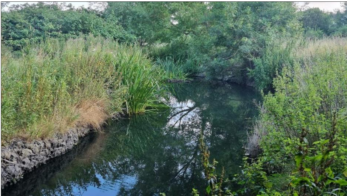
Plate 3.8 Representative image of site 7 on the River Tolka, facing downstream to meander from N3 culvert

Given the moderate value for salmonids, lamprey and European eel, in addition to otter utilisation, the aquatic ecological evaluation of site 7 was of local importance (higher value) (Table 3.5) .