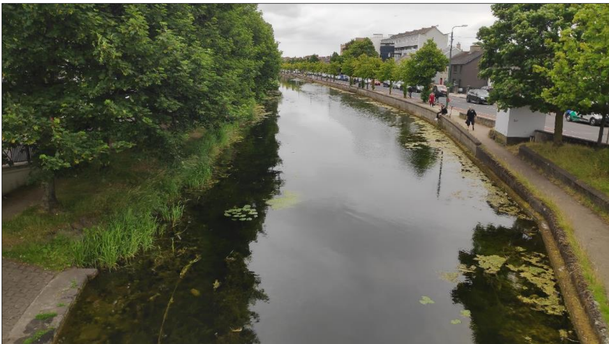
Plate 3.2 Representative image of site 2 on the Grand Canal at Emmett Bridge, facing eastwards from bridge

Given the location of the site within the Grand Canal pNHA (002104), the aquatic ecological evaluation of site 2 was of national importance ( Table 3.5 ). The site was also of high value for coarse fish species, Red-listed European eel and utilised by Annex II otter.