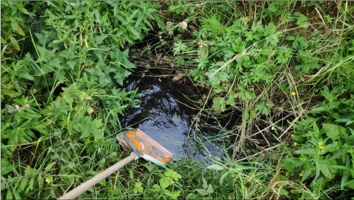
Plate 3.7 Representative image of site 6 on the upper reaches of the River Poddle