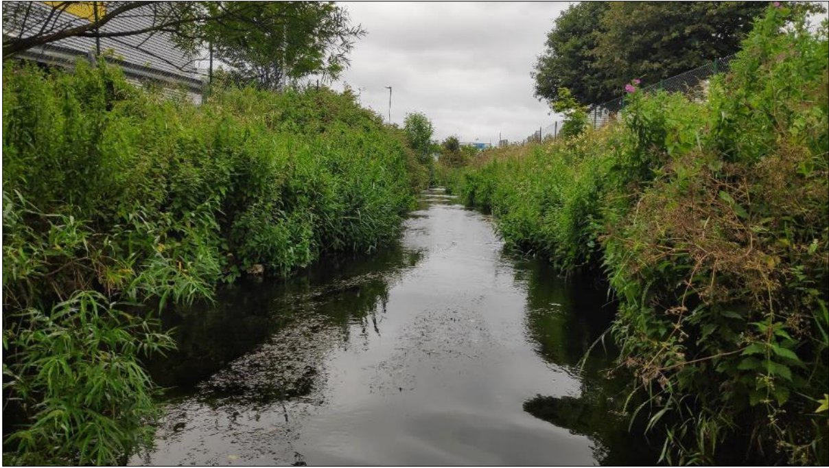
Plate 3.5 Representative image of site 5 on the River Camac, facing upstream from culverts