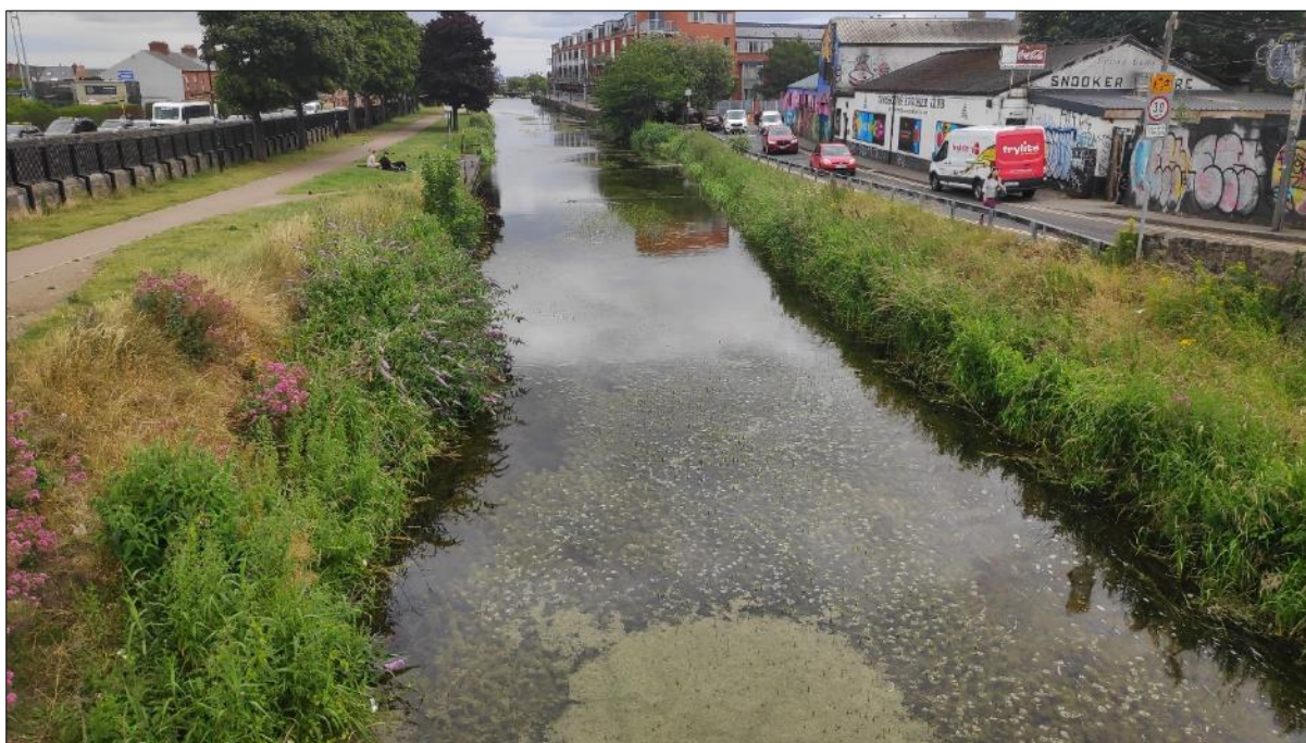
Plate 3.9 Representative image of site 8 on the Royal Canal at Phibsborough, facing downstream from Cross Guns Bridge to the 4 th lock

Given the location of the site within the Royal Canal pNHA (002103), the aquatic ecological evaluation of site 8 was of national importance (Table 3.5) . The site was also of high value for coarse fish species and Red-listed European eel.