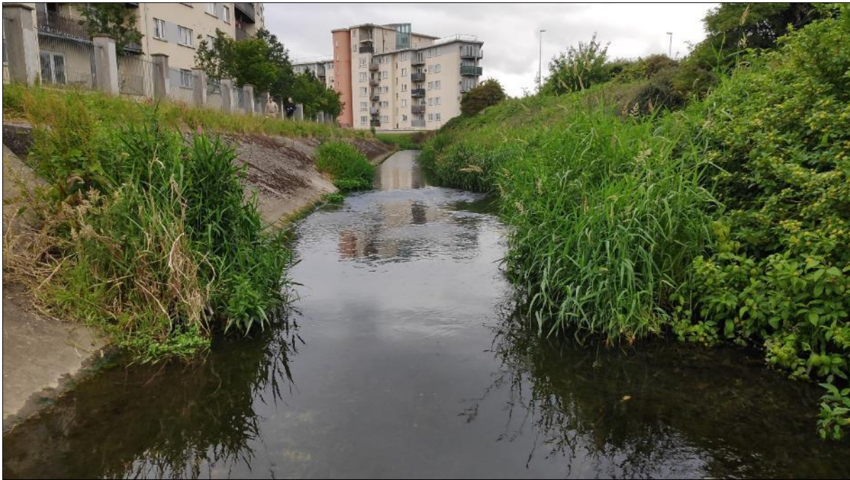
Plate 3.4 Representative image of site 4 on the River Camac, facing upstream towards Áras Na Cluaine