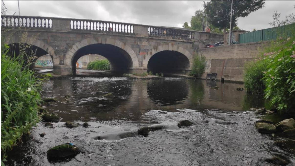
Plate 3.1 Representative image of site 1 on the River Tolka, facing upstream towards Frank Flood Bridge)

Given the presence good quality salmonid, lamprey and European eel habitat and otter utilisation of the site, the aquatic ecological evaluation of site 1 was of local importance (higher value) (Table 3.5) .