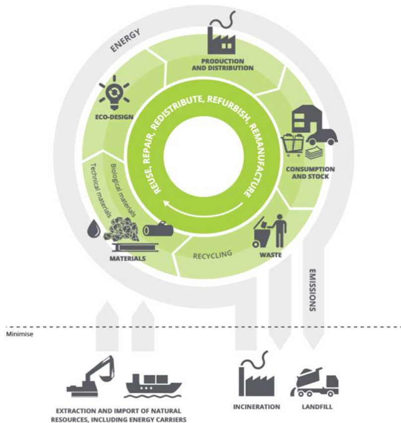
Image 18.1: A Simplified Model of the Circular Economy for Materials and Energy (European Environment Agency (EEA) 2016)

The principal objective of sustainable resource and waste management is to use resources more efficiently, where the value of products, material and resources is maintained in the economy for as long as possible such that the generation of waste is minimised. To achieve resource efficiency there is a need to move from a traditional linear economy to a circular economy (refer to Image 18.1).